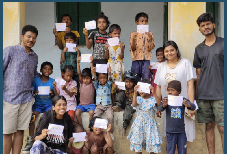
Khojis engaging with kids at Anantmool and created post cards using colors extracted from the flowers during Holi