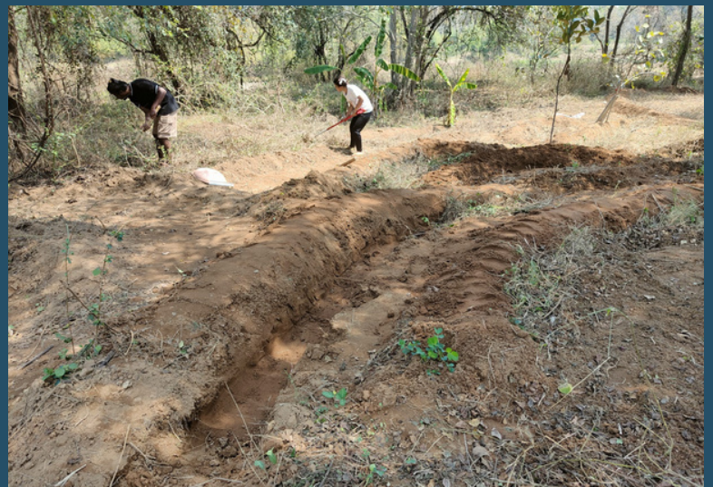
Khojis clearing the land at the Adi Johar for setting up the permaculture farm